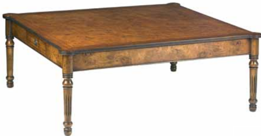
SEYMOUR COCKTAIL TABLE, WITH 2 DRAWERS

Ref. 304: 122cmW x 104cmD x 46cmH Finished in Mahogany (M) or Walnut (W)