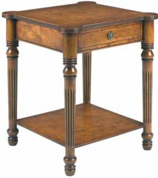
SEYMOUR LAMP TABLE, WITH 1 DRAWER

Ref. 307: 50cmW x 50cmD x 60cmH Finished in Mahogany (M) or Walnut (W)