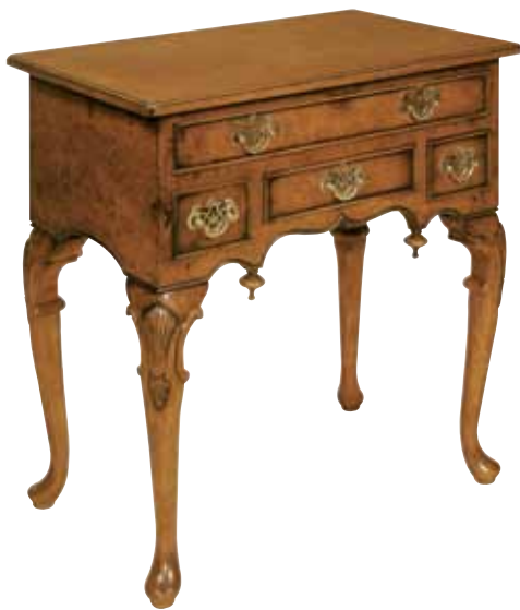
QUEEN ANNE 4 DRAWER LOWBOY

Ref. QA1: 69cmW x 40cmD x 70cmH Finished in Walnut (W)