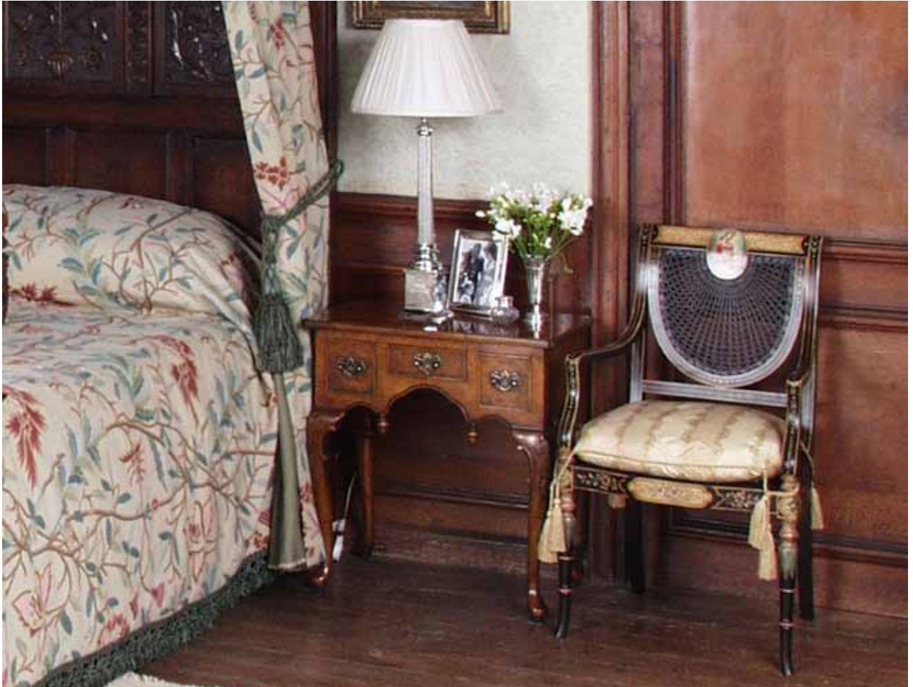
QUEEN ANNE 3 DRAWER LOWBOY

Ref. QA1: 69cmW x 40cmD x 70cmH Finished in Walnut (W)